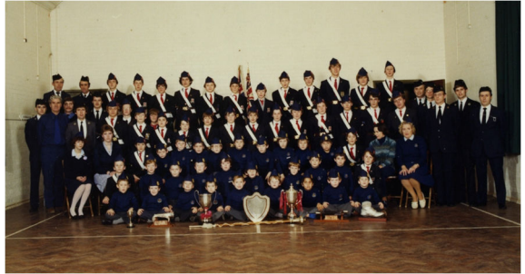
3rd Enfield Company photo for the Centenary of The Boys' Brigade in 1983

In the 1970s and 1980s the 3rd Enfield had continued success in the field of bugle band and drill work. During this era, they won the Devonshire Cup a further four times (1972, 1978, 1979 and 1982), the Bugle Team four times and the Solo Bugler twice. In 1972 they appeared on TV playing at the Football League Cup final at Wembley. They won the very last Devonshire Cup final held at the BB Royal Albert Hall Display in 1982. The Company also won the London District Two Section Drill trophy ten times. For four years in a row, during the 1980s, they won the Daily Telegraph Shield with the 1st Enfield.