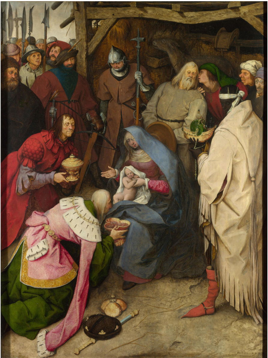
The Adoration of the Kings , Pieter Bruegel the Elder 1564, National Gallery, London. A related article by Stephen Gilburt can be found on pages 20-21.