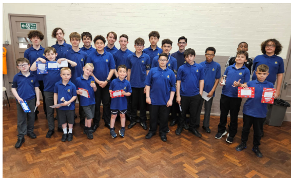
Members of the 3rd Enfield Company at the Awards Evening in 2024

celebrations to mark the 80th anniversary of the end of the Second World War, etc. The 3rd Enfield remains a strong BB Company today.