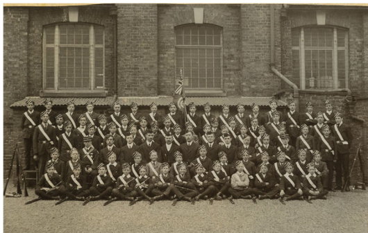
The Silver Jubilee of the 3rd Enfield in 1908

Between 1906 and 1920 the 3rd Enfield won the Daily Telegraph Shield no less than seven times and appeared in nearly every